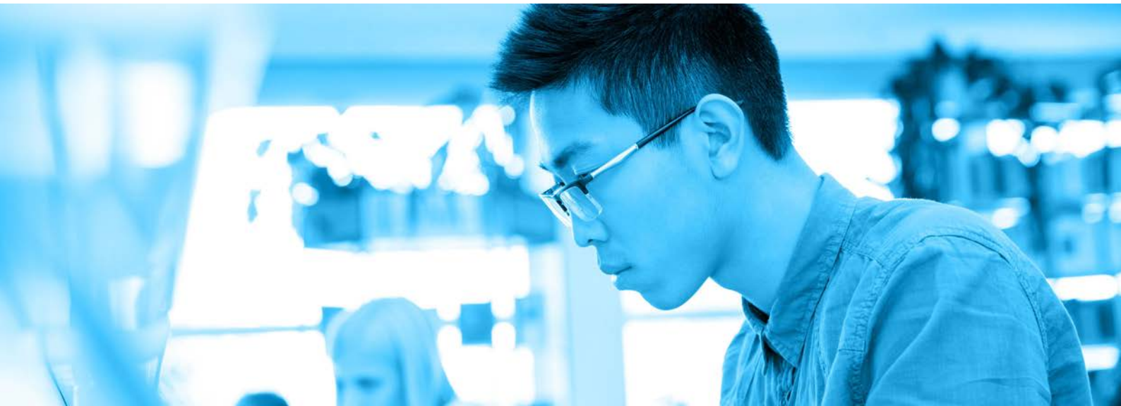
Table 1.8 Average scale scores on 2017 NAEP, grade 8 reading, by hours spent every day on the computer at school for English/language arts work and school poverty level