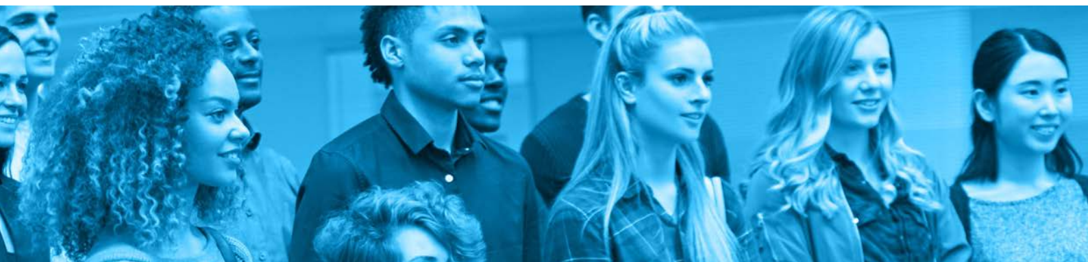
Table 1.3 Partial correlation coefficients for PISA performance and classroom technology exposure, after accounting for GDP per capita and mean performance on mathematics, reading, and science scales in 2003 and 2006 , OECD nation level

Note: A partial correlation coefficient represents the strength of the relationship between two variables when controlling for the effects of potentially confounding variables. Values lower than -.4 and higher than .4 are considered strong associations, and values reported in bold are statistically significant and indicate a p-value less than 5 percent.