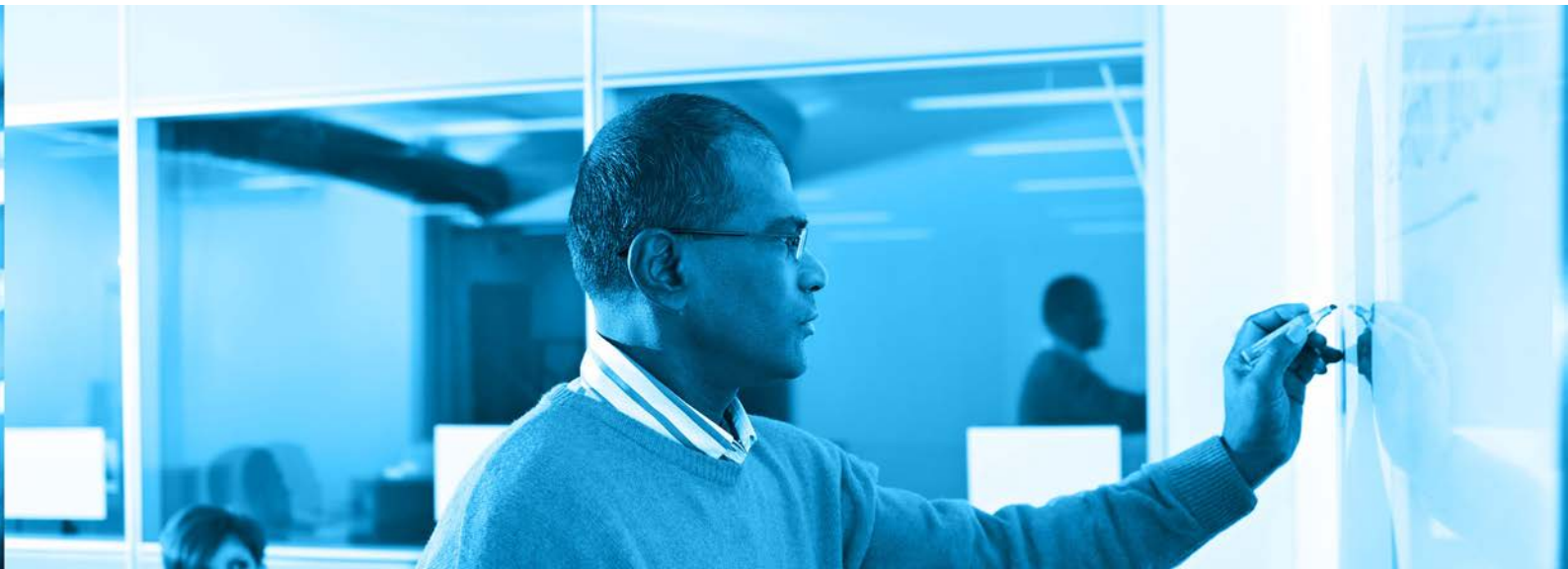
Table 1.9 Average scale scores on 2017 NAEP, grade 8 math, by computer-based learning activity and reported frequency

A similar trend occurred among students whose teachers reported receiving training in technology-based instruction. As shown in Table 1.10, students in this group who reported “never or hardly ever” using the computer to research math topics on the Internet scored 3 points lower on the math exam than their peers who reported doing this activity “once or twice a year.” However, non-users still scored 5 points higher than students who reported doing this activity “every day.”