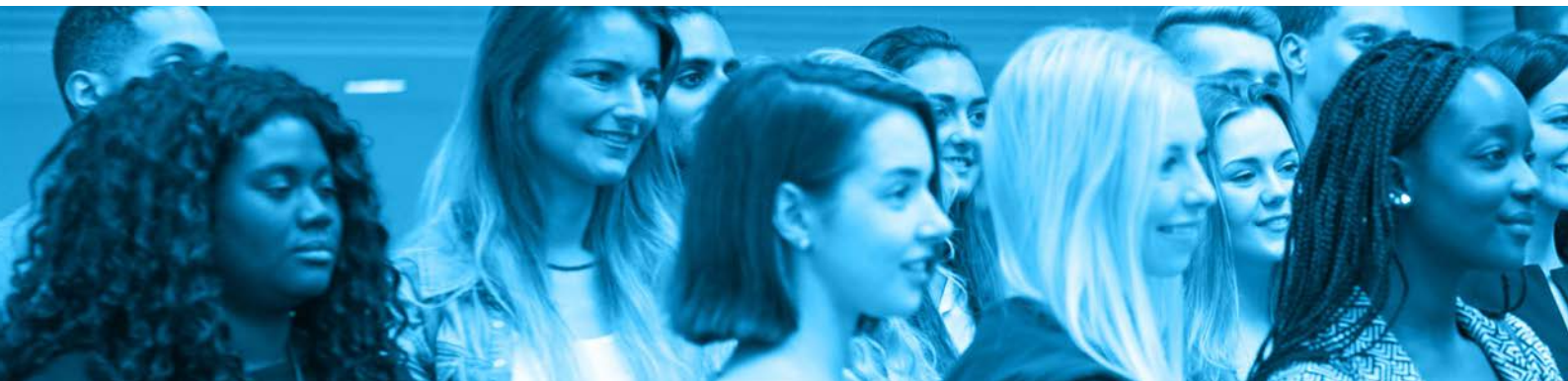
Table 1.1 Correlation coefficients for 2015 PISA scale scores, OECD nation level

The relationship between technology and student outcomes initially appears positive in a simple linear regression model. But Table 1.1 shows that only a few of these associations were statistically significant. When we controlled for variation in GDP per capita like in the original study, most findings remained statistically insignificant, but some results illustrated a mildly negative relationship, as shown in Table 1.2. After we controlled for 2003 and 2006 PISA performance — like the previous authors did — nearly all associations were mildly negative. These findings were statistically significant, as illustrated in Table 1.3.